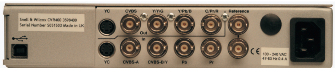
KP15 01/08 V2