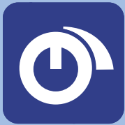
RollMap Control Panel